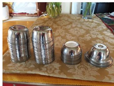
Metal bowls under the altar (8 x 8 bowls = 64 bowls + 4 bowls (Torma) = 68 bowls)

If the Puja is done on behalf of somebody who is sick or died, or it was requested and offered by someone extensive offerings can be arranged and at the end