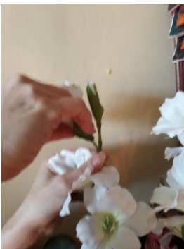
Flowers from bouquet on altar

1 vertical row of 4 bowls: rice + Torma (nectarines)